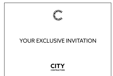
File 3: Foil Only