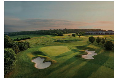
File 2: Print Only